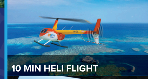
SCENIC HELI - ONE WAY