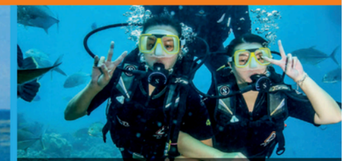
INTRO SCUBA DIVE