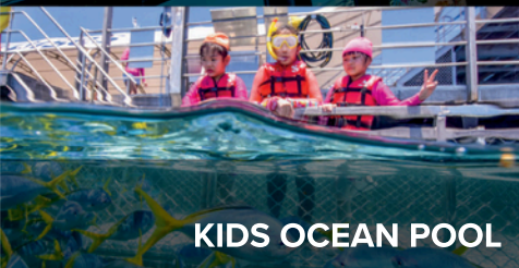
KIDS OCEAN POOL