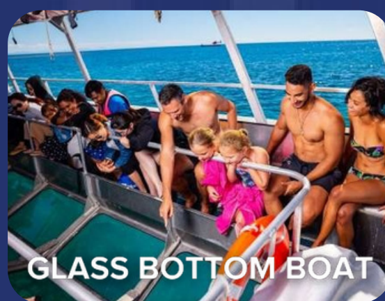
GLASS BOTTOM BOAT