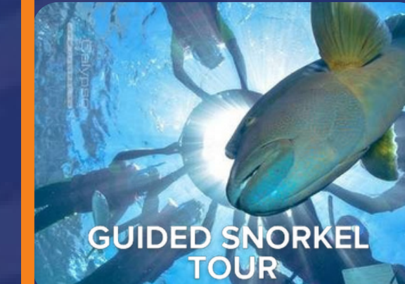
GUIDED SNORKEL TOUR