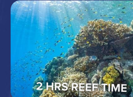
2 HRS REEF TIME