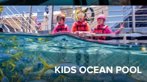
KIDS OCEAN POOL