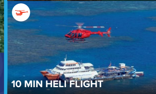
10 MIN HELI FLIGHT