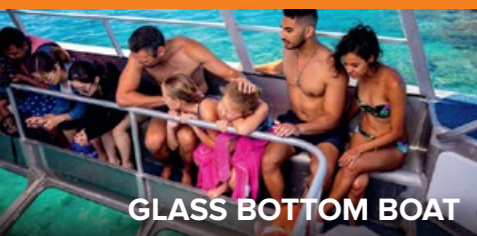
GLASS BOTTOM BOAT

seasonal departure and scheduling changes may apply