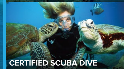
CERTIFIED SCUBA DIVE