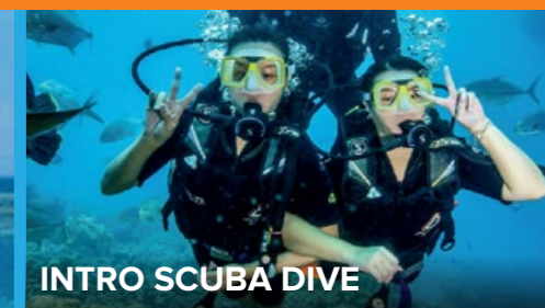
INTRO SCUBA DIVE