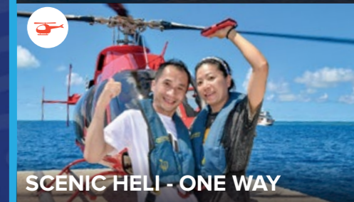
SCENIC HELI - ONE WAY