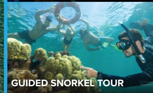
GUIDED SNORKEL TOUR